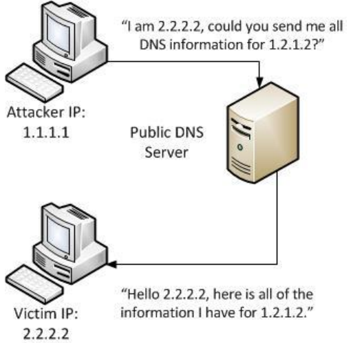
Figure 2: Example DNS Reflection DDoS with Amplification

attacker spoofs its IP address, pretending to be the victim, and requests all known data from a public server. This results in the attacker sending a request that is small in size, but results in the public server responding to the victim with a large amount of data.